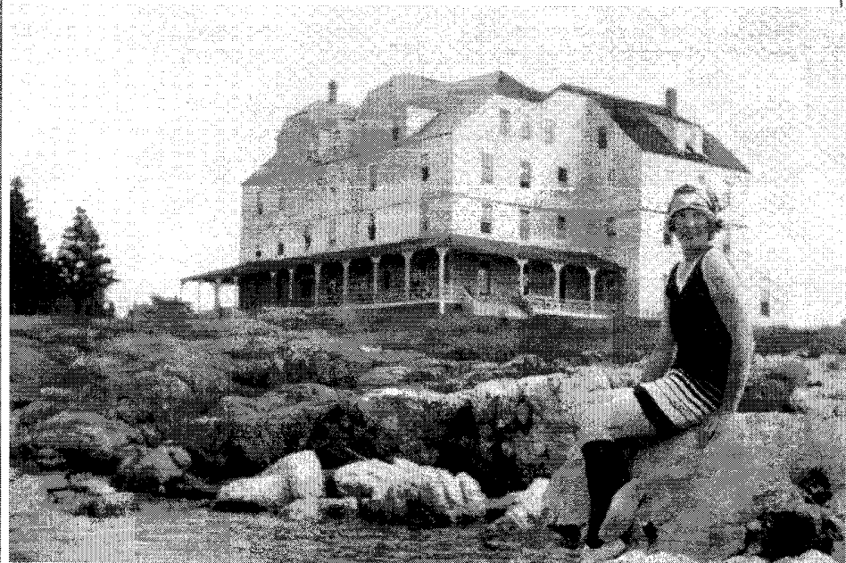
Photo of the Stanley House in Manset, which was located where the Spahr Cottage is presently located.