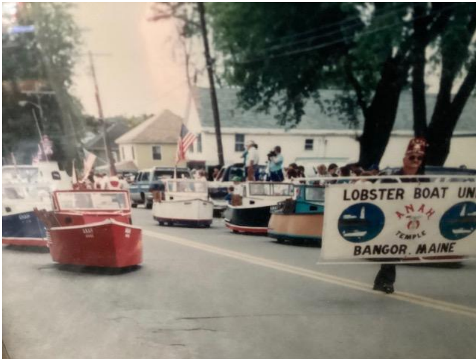
Annah Shriener boat floats