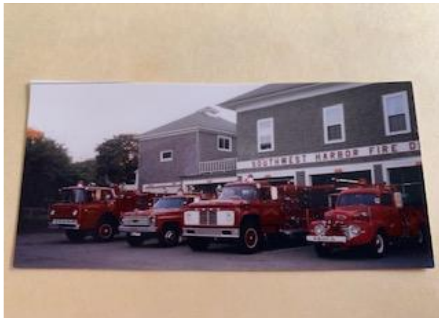
Photo of Southwest Harbor Fire Dept.