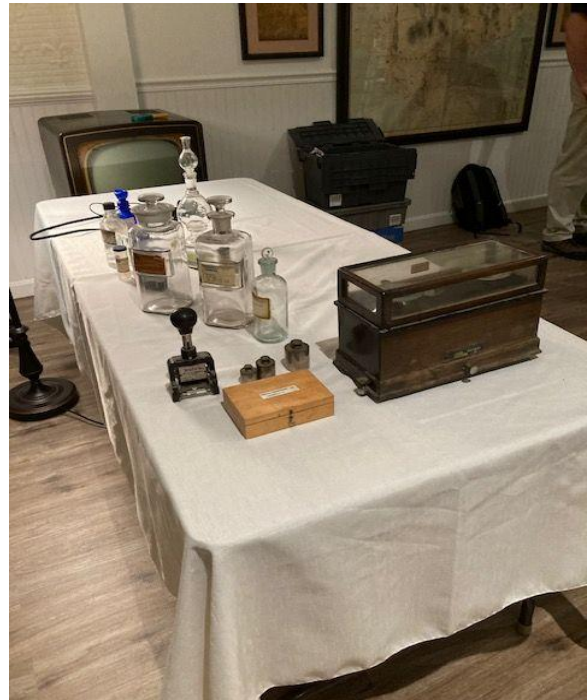
Artifacts brought by Eric for the program

We changed the membership dues structure starting in 2022 to being on an annual basis of