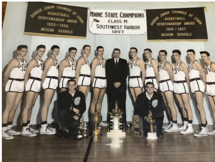
Pemetic Gold Ball team '57

Trivia question! Can you name all members of the 1957 Championship team, Head Coach, and Assistants?