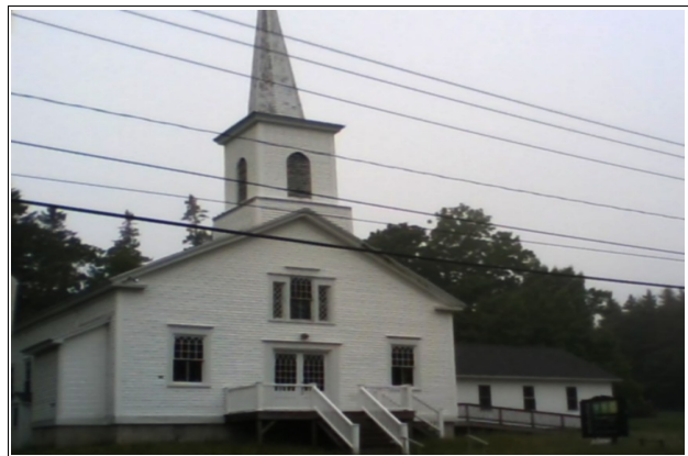
The church as it appears today