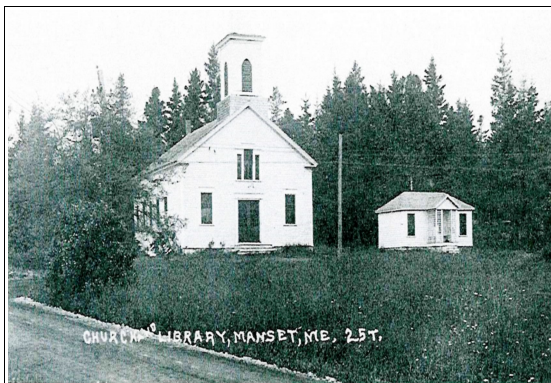
Manset Church and Library.

Eighty years ago on November 10, 1937 this is what the north side of the Manset Union Church looked like. In a news article dated November 15, the Bar Harbor Times said, "The new parish house [known as the Gleaners Hall] at Manset, built only last summer, was destroyed by fire shortly after midnight last Wednesday night. The building was on the same lot with the historic old church, built in 1816. The church was badly scorched, and the windows broken on the side toward the fire. The library close by was also damaged to considerable extent, though the books were saved.